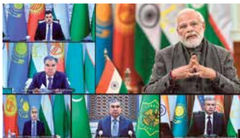
Prime Minister Narendra Modi at the India-Central Asia Summit, held via video link from New Delhi on Thursday.

The leaders also spoke at length about concerns over Afghanistan, sharing the "same concerns and same objectives" in broader terms and agreed to setting up a Joint Working Group (JWG) of senior officials, said Re-