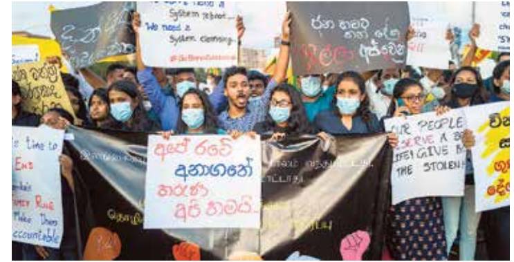
Protesters shout slogans demanding President Gotabaya Rajapaksa's resignation over the country's crippling economic crisis.

The origins of the linguistic disenfranchisement of the Tamils owed partly to the appeasement of the Buddhist clergy, which is almost exclusively Sinhala. It not only caused the alienation of the Tamil-speaking population but led to the formation of the Tamil Tigers, a terrorist organisation, and a civil war. The Tamil Tigers were finally vanquished, but it took over two-and-a-half decades for the Sri Lankan state to achieve this. In the meanwhile, there was an exodus of Tamils, the better-off leaving for the West and, those who could escape, heading for Tamil Nadu.