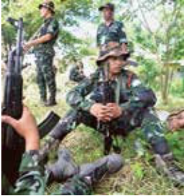
Cadres of the NSCN-IM.

At the time of the withdrawal of the British, insecurity grew among the Naga tribes about the future of their cultural autonomy after India's independence,