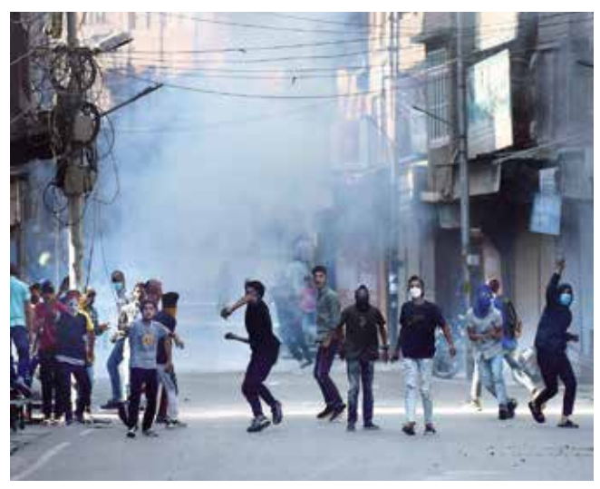
Tense moments: Protesters clashing with police in Srinagar on Wednesday.

Protesters raised pro-Malik and pro-freedom slogans and many clashed with the security forces. Police used