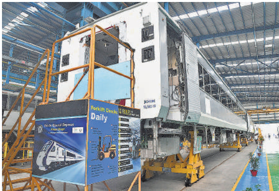
New features: A view of a Vande Bharat train cabin under production at the Integral Coach Factory.

the overall target of 25 such trains had been set.