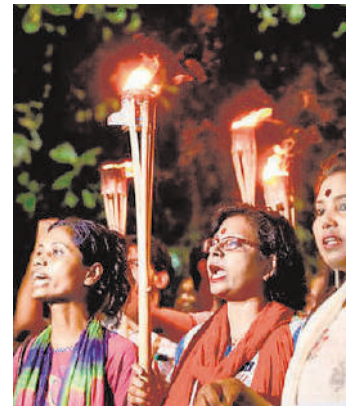
A file photo of activists during a protest in Dhaka.

"We do not welcome this special law from India. Such laws are not helpful. We do have certain problems like