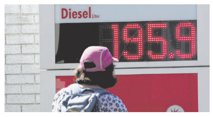
Global hit: Higher interest rates to tame prices in developed countries have led to capital outflows, hurting the rupee. •AP

Higher energy prices and interest rates in developed economies have led to capital outflows and rising commodity prices, pressuring the rupee.