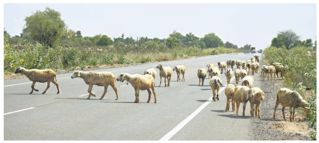
Feeling the heat: (Top) Farmers filling a concrete pond with water for wild animals to quench their thirst near a field at Lakhasar Rohi village in Rajasthan's Hanumangarh district; and a flock of sheep wandering in search of water on a sweltering afternoon in May in Churu district.