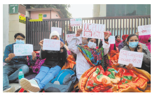
Standing up: Urban Company's employees sitting on a protest in Gurugram in December 2021.

jobs stopped, she was called for a meeting at the UC office on March 16. "I met my category manager who said I had been blocked for attending the protest last year," she said.