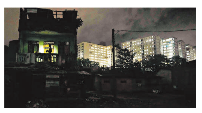
In the dark: A man using his mobile phone torch during a power cut in Colombo in Sri Lanka. The island-nation has been in the throes of an acute power shortage.

The President's office followed up with a statement "vehemently denying" the CEB official's remarks. "Sri