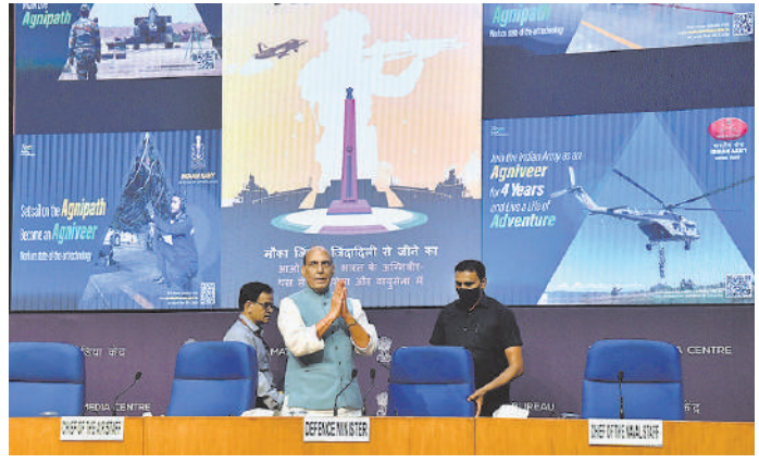
Defence Minister Rajnath Singh announcing the rollout of the 'Agnipath' scheme on Tuesday.

The move is expected to decrease the average age profile of armed forces personnel from the current 32