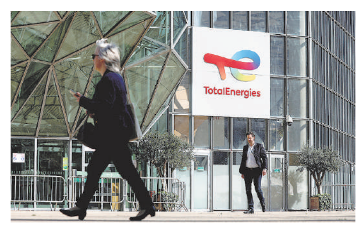
Going green: Total Energies aims to use the JV to decarbonise the hydrogen used in its European refineries.

"In our journey to be the world's largest Green H2