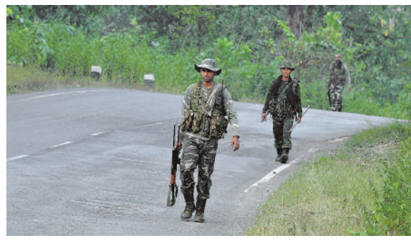
High priority: In 2020, only 10,184 CAPF posts were filled, while vacancies stood at 1.29 lakh.

A senior Ministry official said the details were being worked out, but 'Agniveers' would be given priority when they completed the four years of military service. Union Home Minister Amit Shah said on Tuesday that the Ministry had taken steps to fill vacancies in mission mode in accordance with Prime Minister Naren-