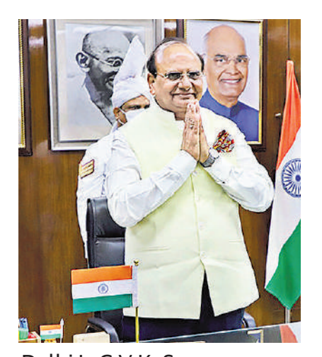
Delhi L-G V.K. Saxena.

The move would mean doing away with the use of Farsi in official communication and documentation, sources said. The aim of doing away with archaic lanauge in official communication is in-