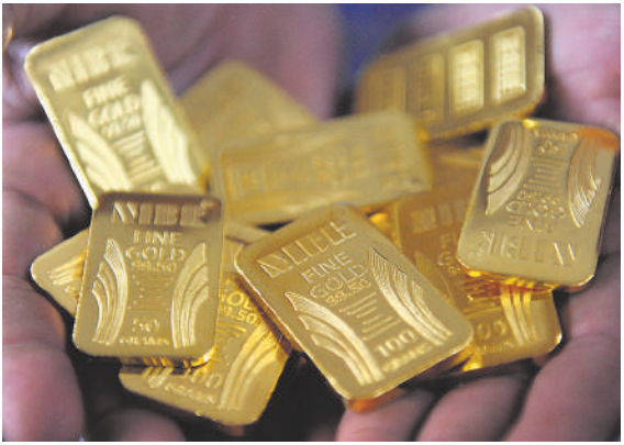
Lure of yellow metal: Gold imports vaulted to $6 billion, from $677 million in May 2021.

Commenting on the data, ICRA Ltd. chief economist