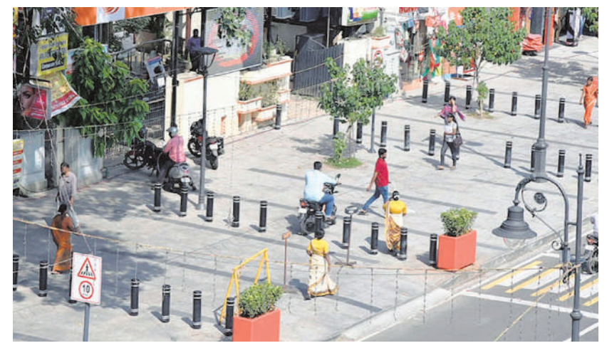
Well planned: A view of the Pondy Bazaar pedestrian plaza in Chennai, a public space included in the compendium.

jects selected for the compendium would be the spaces where the government's Harmonised Guidelines and Standards for Universal Accessibility in India that is in the process of being updated will be implemented. "Going forward, we want these public spaces to be the model where our harmonised guidelines are implemented fully. The point is to learn, not duplicate," Mr. Vaidya said.