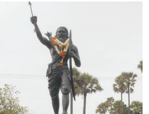
Standing tall: The statue of the revolutionary freedom fighter Alluri Sitarama Raju on Beach Road in Visakhapatnam..

Has today's India adequately heard about Alluri and the Rampa Rebellion? For that matter, the Rampa