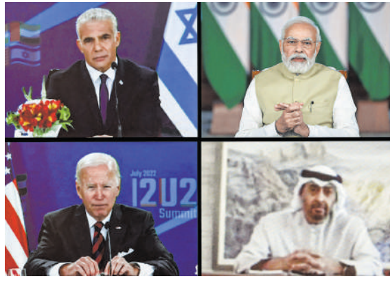
Common concerns: Prime Minister Narendra Modi addressing the I2U2 virtual summit from New Delhi on Thursday.

India will provide "appropriate land" for "food parks" across the country that will be built in collaboration with Israel, the United States and the United Arab Emirates. The plan for the "integrated food parks" was announced in a joint statement after the leaders of the I2U2 grouping - India, Israel, the UAE and the U.S. – held a summit on Thursday. The leaders said they would bring in private capital for specific projects in the fields of water, energy, transportation, health, space and food security.