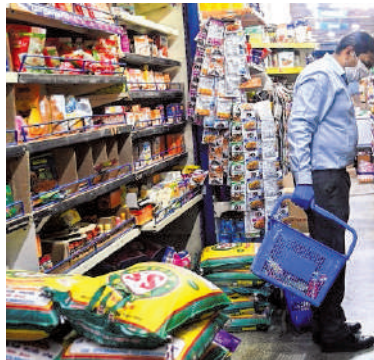
Pre-packed food items will attract a 5% GST.

such as printing, writing or drawing ink; knives with cutting blades, pencil sharpeners; LED lamps; and drawing instruments will be hiked to 18% on Monday, from 12% currently, to correct the inverted duty anomaly. Solar water heaters will now attract a 12% GST from the 5% earlier.