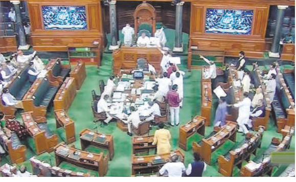
Opposition members staging a protest in the well of the Lok Sabha during Monsoon Session of Parliament on Monday.

Mr. Naidu who is presiding over the last session of his tenure that will come to an end on August 10, said that 57% proceedings were