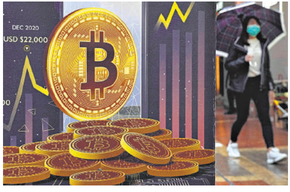
Joint task: 'Cryptocurrencies are borderless and require international teamwork to prevent regulatory arbitrage'. • AP

"Any legislation for regulation or for banning can be ef-