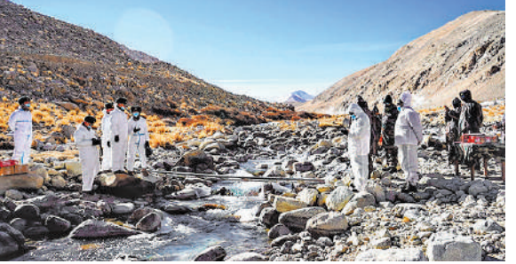
Talks under way: India and China have agreed to stay in close contact and maintain dialogue. • PTI

The talks held at the Chushul-Moldo border meet-