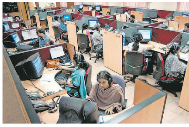
Gathering clouds: International demand worsened with new global orders seeing the sharpest drop in six months. •ksl

Input cost inflation remained a concern for busi-