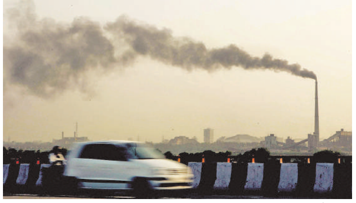
Net zero: India aims at putting an end to dependence on fossil fuels by 2070.

The Union Cabinet. chaired by Mr. Modi, on Wednesday approved an update to India's Nationally Determined Contribution (NDC). Mr. Modi had laid out five commitments, or Panchamrit, as the government references it, namely: India will increase its non-fossil energy capacity to 500 GW (gigawatt) by 2030; will meet 50% of its energy requirements from "renewable energy" by 2030; will reduce the total projected carbon emissions