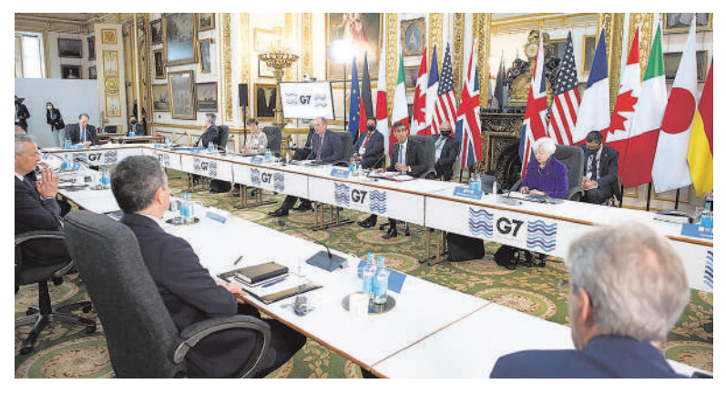
Tough posturing: A file photo of the G7 Finance Ministers.

The actual ceiling price was not announced, with the G7 saying it invites "all countries" to provide input. The initial price cap will be