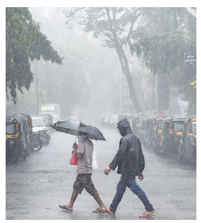
This year, the monsoon is already in surplus by about 6%, rainfall data show.

In 2020, India saw 9% more rain, with August registering 27% more rain and September 4% more than its