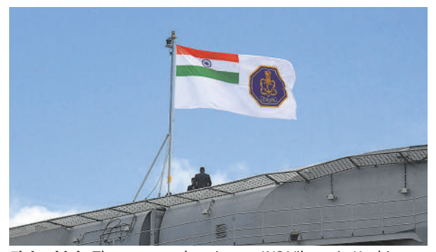
Flying high: The new naval ensign on INS Vikrant in Kochi on Friday.

"The President of India has approved the introduction of the new designs of the naval ensign, as also the distinguishing flags, masthead pennants and car flags for the Indian Navy," the Navy said in a statement. "Formations, ships and establishments of the Indian Navy would be adopting the new naval ensign, as also the new