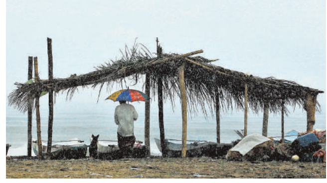
Mixed feelings: Though they recognise the need for foreign capital, farmers feel in this case it will only do them harm.

In 2021, Sri Lanka exported about 336 tonnes of sea cucumber to China, Singapore, and Hong Kong, according to local media reports. Desperate to find dollars to stabilise its battered economy, the Sri Lankan government appears to