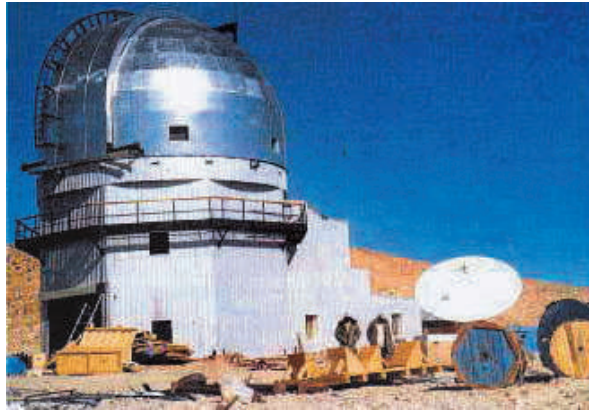
Reaching the stars: The Himalayan Chandra Telescope at Hanle in Ladakh.

A dark sky reserve is a designation given to a place that has policies in place to ensure that a tract of land or region has minimal artificial